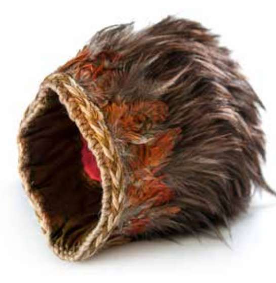
Kiwi and kākā feather muff , 19<sup>th</sup> Century, gifted by E J Herrick, 64/137

To name your own feather, or to find out more, scan the QR code to visit www.themtgfoundation.com. Or email hello@themtgfoundation.com.